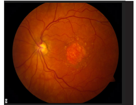
Advanced stage of dry AMD